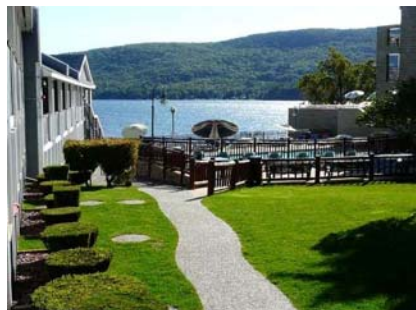
Surfside on the Lake Hotel